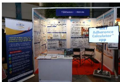
I-TECH India stall at the event

Posters, brochures, and pamphlets and a virtual display of different applications of various program activities were put up in the stall. Interventions such as Rapid response to sustain HIV treatment continuity during COVID-19 pandemic, Health on Bike, Transgender Health and Wellness Centre, Complementary services for improved HIV service uptake, Interactive Voice Response System (IVRS) were highlighted.