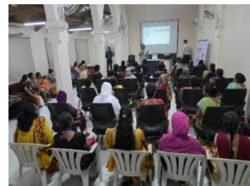
Health talk during Swayam Arogya Mela

Health check-up camps were held for the widows among the Women Living with HIV (WLHIV) from the ART centres in Mumbai. Screening for diabetes, hypertension, and Bone Mineral Density (BMD) test were conducted. The Arogya Mela also raised awareness on social protection schemes, appropriate diet and nutritious recipes and health talk on improving adherence for viral suppression. Around 262 WLHIV attended the event at MDACS, Mumbai. The WLHIV were also provided dry ration kits.