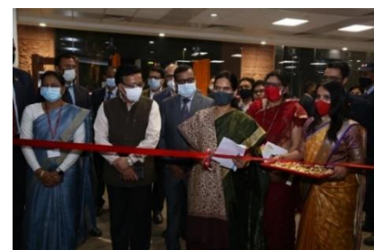
Guest of honour commencing the event