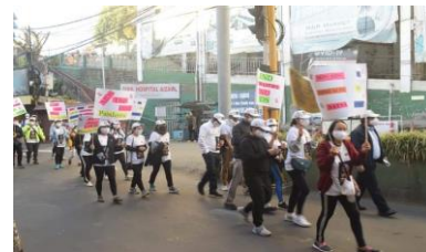
HIV awareness rally in Mizoram

A Community Consultation was organised to commemorate the World AIDS Day 2021 by Mizoram SACS in collaboration with I-TECH India. The consultation was attended by leaders of PLHIV community, representatives from Positive Women Network of Mizoram (PWNM), Mizoram State Network of Positive people (MISNOPP), VIHAAN, OVC and officials from CDC India, I-TECH India, PATH, Alliance India.