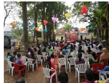
Anand Mela at MDACS, Mumbai

165 adolescents actively participated in the Anand Mela, an event for Adolescents Living with HIV (ALHIV) was held on 4 th December 2021. Infotainment activities included street play, flash mob, songs and dance performances by adolescents, fashion show, tattoo, and bead-making stations etc. The ALHIV were also provided with a daily usage kit containing bag, bottle, nutrition packets, t-shirt, cap, mask, and sanitizer.