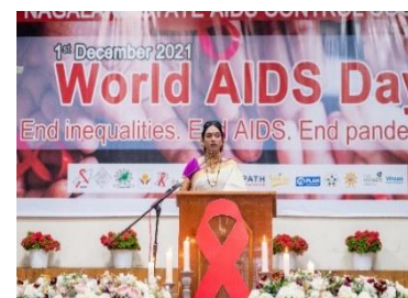
Address to the audience on U=U

I-TECH India's Technical Specialist (Key Population) addressed the audience and spoke on the importance of greater involvement of transgender into the program and the importance of U=U. She shared that it is the first time that transgender inclusion has happened in the state and its huge achievement for the SACS. She added that there is a need to strengthen 95-95-95 activities and address the issues associated with stigma. She stressed that equal health access should be made available to the vulnerable communities.