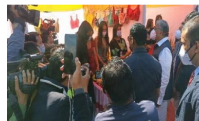
Transgender displaying their creativity

During the state level observance, I-TECH India, Maruploi Foundation and Transgender Health and Wellness Centre (TGHWC) opened a stall showing the creativity of the transgender community by displaying the garments woven by them. Hon'ble Governor of Manipur Shri La. Ganesan, Hon'ble Chief Minister Shri N Biren Singh and officials visited the stalls to interact with the staff of TGHWC.