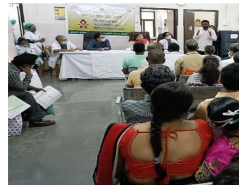
Health talk by Nutritionist at Nair ARTC, Mumbai

Nearly 1300 PLHIV participated in the health talks conducted for elderly PLHIV across 20 ARTCs. These PLHIV were mobilised to be part of the elderly (age group of 60 and above) self-help groups (SHGs), which will provide peer support for mental wellbeing, treatment adherence and retention in HIV care. I-TECH India facilitated the health talks through a nutritionist on balanced diet and hypertension prevention and care for the geriatric (elderly) population at the ART centres in Mumbai.