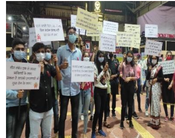
Flash mob performers with placards on HIV prevention

Flash mob events were held across nine major railway stations to raise awareness on HIV/AIDS and mobilise individuals for HIV testing. More than 3000 people were reached with the messages through the flash mobs.