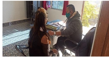
Health camp in Manipur