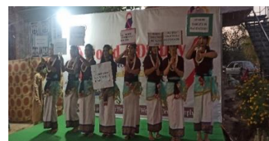
Cultural program in Manipur

A cultural program by the transgender community based on the theme of 'End Inequalities, End AIDS, End Pandemics' and 'U=U' was organised through the Transgender Health and Wellness Centre.