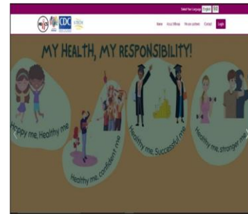
mitwaa.net Home Page

I-TECH India's LMS platform - mitwaa.net had a soft launch during the Anand Mela. Mitwaa.net is a part of the I-TECH India's MITWAA initiative for ALHIV seeking treatment at the ART centres in Mumbai launched in collaboration with MDACS and CDC India. Around 1000 ALHIV seeking antiretroviral treatment from the treatment centres in Mumbai are expected to benefit from the mitwaa.net LMS platform.