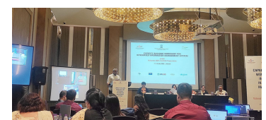
SOCH Training (Assam)

Support for Strengthening Integrated Information Management Systems: I-TECH India, in coordination with NACO, conducted the training workshop on Strengthening Integrated Information Management Systems for NE region (11-15 July 2022). The training focused on 'SOCH—Strengthening Overall Care for HIV Beneficiaries,' a beneficiary-centric, web- and mobile-based system integrated with other MOHFW IT systems. The system will capture inventory and service delivery information pertaining to individual beneficiaries throughout the HIV continuum, creating a centralized repository of electronic health records and facilitating forecasting, inventory planning, and clinical decision support. A total of 113 participants attended this workshop including officials from NACO, SACS (Odisha, West Bengal and 8 NE states) and partner organisations.