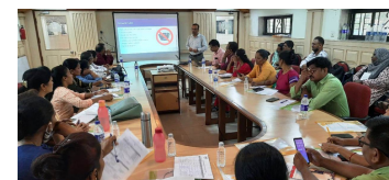
Training of counsellors on KP groups vulnerability (Mumbai)

Training of Healthcare Provider on understanding Key Population groups, vulnerability, and disclosure counselling: To fast-track index testing among Key Population (KP), it is imperative to have better understanding of KP groups, vulnerability patterns, sexual networks, barriers in accessing HIV services, and skills to encourage disclosure with sexual partners. I-TECH India facilitated three batches of one-day training on 'disclosure' for 72 counsellors from ICTC and DSRC centers in Mumbai (06 - 08 June 2022).