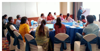
I-TECH India facilitating group work during OSC workshop (Delhi)

National consultation of One Stop Centre for Key and Bridge Populations in HIV care: I-TECH India participated and facilitated a session at the 'National Consultation of One Stop Centre (OSC) for Key and Bridge Populations in HIV care' which focussed on concretizing the concept of one stop centers and exploring the strategies and service components in implementation of one stop centers for key and bridge population (20-21 June 2022). The objective of the consultation also focussed on developing strategies for implementation of venue based integrated service delivery based on existing experience of Delhi.