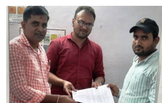
Private sector engagement (Mumbai)

Expanding Private Sector Engagement in Mumbai: Early diagnosis of HIV, as well as linkage to appropriate prevention and treatment services is crucial to control the spread of HIV. I-TECH India, in collaboration with Mumbai Districts AIDS Control Society (MDACS), has formalized an agreement with four laboratories in the private sector located at places convenient to key population (KP) clients in Mumbai. These laboratories will provide HIV and sexually transmitted infection testing services to KP clients at subsidized rates, thus improving service uptake and early detection.