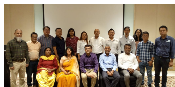
Training on Cross-Border intervention (Assam)

Training on Cross-Border Interventions: I-TECH India, CDC India, and PATH facilitated a one-day training on cross-border interventions, planning provision of comprehensive HIV services in the border areas of Mizoram, Manipur, and Nagaland (03 June 2022). The training focused on assessing spaces of vulnerability, cross-border migration patterns, the effects of injection drug use, sexual behavior, and sexual networks. Interventions such as community consultations with key population (KP) groups and the involvement of key stakeholders are planned as next steps for improving service uptake in border areas for HIV prevention and risk reduction.