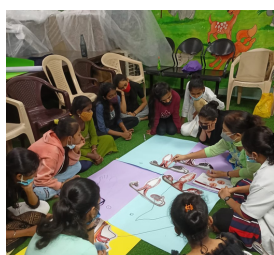
Training of ALHIV under Mitwaa (Mumbai)