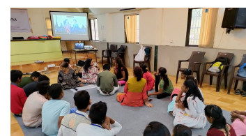
Training for ALHIV under Mitwaa initiative (Mumbai)

Empowering Adolescents Living with HIV (ALHIV) in Mumbai under the MITWAA Initiative: In collaboration with Mumbai District AIDS Control Society (MDACS), I-TECH India organized a three-day training session for 76 ALHIV in Mumbai. The session's objectives were to improve skills in effective communication, interpersonal relations, decision-making, and self-management, as well as ART adherence, nutrition, and sexual and reproductive health. A career guidance session was also organized for adolescents aged 15-17 years to provide information on the available options for higher education. A total of 56 adolescents attended the career guidance session.