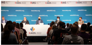
IAS 2022 Conference (Montreal, Canada)

E-poster presentation at the 24th International AIDS Conference: The 24th International AIDS Conference (IAS) was held from 29 July – 02 August 2022 at Montreal, Canada. More than 12500 delegates including researchers, program specialists, community activists, donors and stakeholders attended the conference which focused on next generation HIV response through scientific research, emphasis on dialogues with communities who are left behind, sustainable finance discussions and understanding the success stories on prevention and care across the globe.